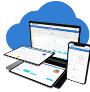
SS-GT24B-A SensorSpace Ethernet Gateway