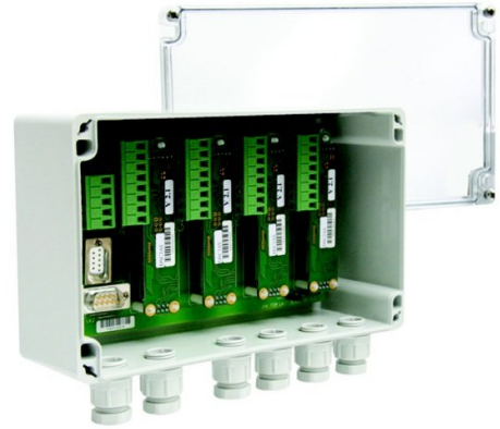
Photo showing DSJ4 with 4 x DSC pcb cards fitted